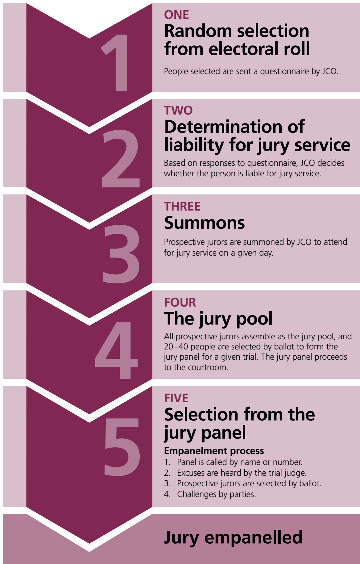
Figure 1: Jury selection and empanelment process